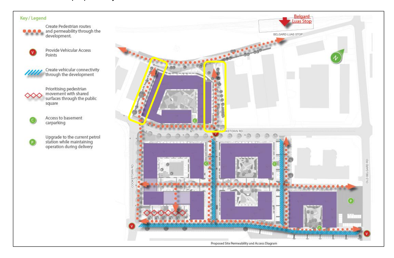
Figure 4.0 Proposed Connectivity - Site Permeability Diagram included in the Design Statement, prepared by C+W O'Brien Architects, with pedestrian cycle links provided to Luas Stop encircled in yellow