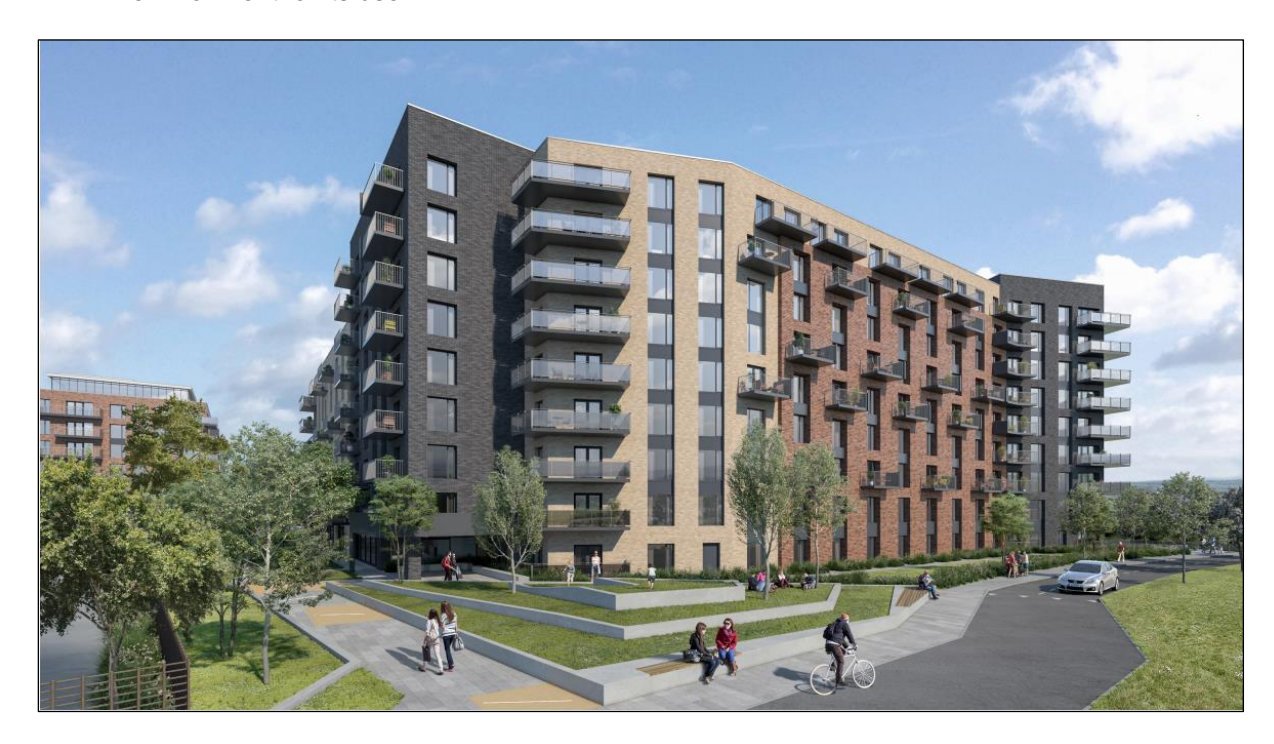
Figure 5.0 CGI, prepared by 3D Design Bureau illustrating the high quality pedestrian and cycle path provided adjacent to Block - taken from north-east corner of the site looking south-west