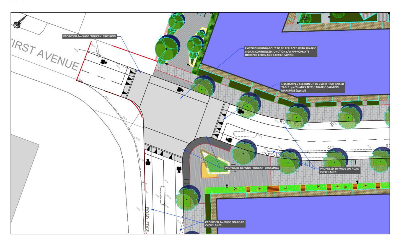
Figure 10.0 Excerpt from Drawing No. NRB-TA-002, prepared by NRB Consulting Engineers, included at Appendix A of the Transportation Assessment Report

The cycle infrastructure proposed is best illustrated in the drawing excerpt included in Figure 10.0 below.