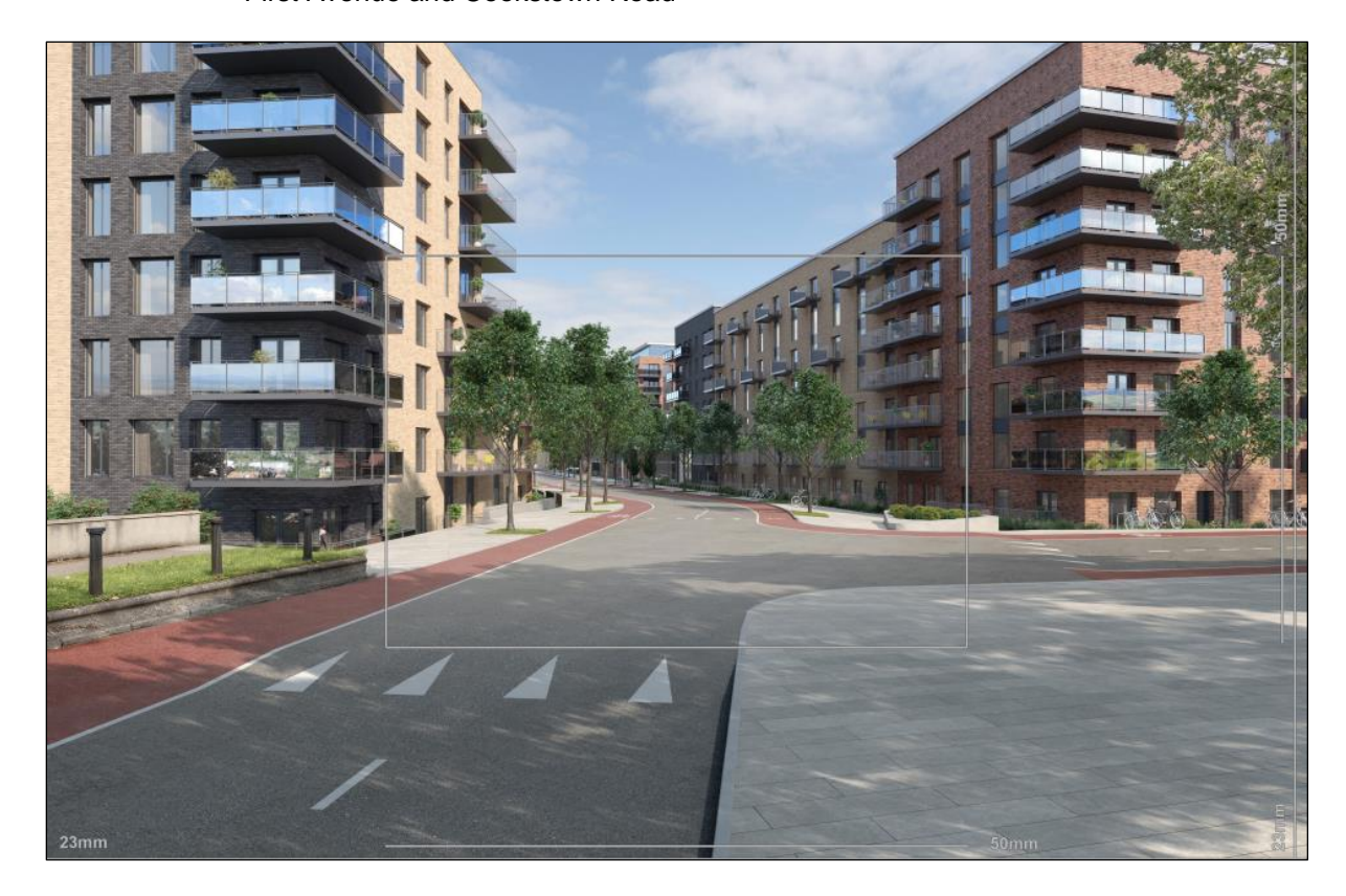
Figure 9.0 Verified view montage, prepared by 3D Design Bureau, of the proposed junction/roads at the intersection of First Avenue and Cookstown Road