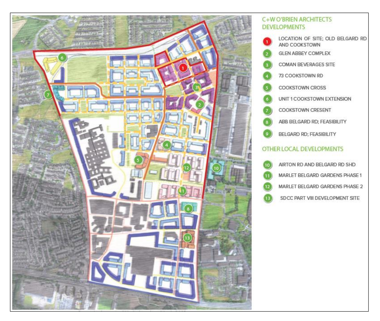
Figure 1.0 Excerpt of Masterplan, prepared by C+W O'Brien Architects, illustrating developments approved/proposed in the Cookstown Industrial Estate

The challenges presented by the construction of new mixed use and residential development in an existing, albeit transitioning, industrial area are fully recognised by the applicant. Accordingly, the applicant has had full regard to recent planning decisions in the area and welcomes the adoption of the new Local Area Plan which now provides the planning framework that ABP previously considered lacking. Within this framework in place this development will act as a catalyst to the transformation of this industrial estate into a series of interconnected residential and mixed use neighbourhoods.