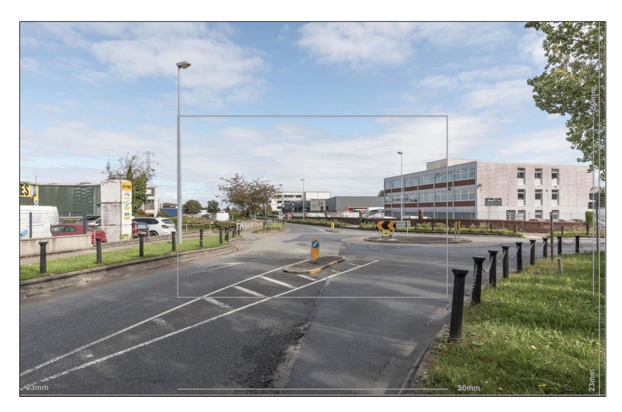
Figure 8.0 Image of the existing junction/roads at the intersection of First Avenue and Cookstown Road