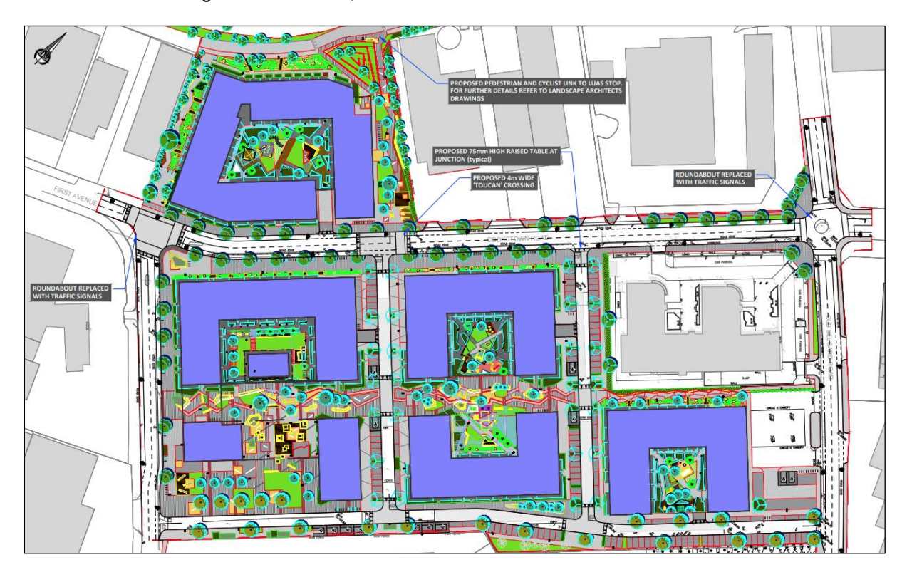
Figure 7.0 Excerpt from Drawing No. NRB-TA-001, prepared by NRB Consulting Engineers, included at Appendix A of the Transportation Assessment Report

The upgrade works proposed to the existing industrial estate roads and associated junctions are best illustrated in the drawing excerpt included in Figure 7.0 and the photomontages/CGIs included in Figures 8.0 and 9.0, below and overleaf.